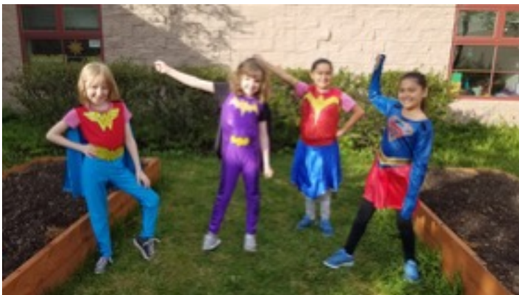
1st grade Super Heros